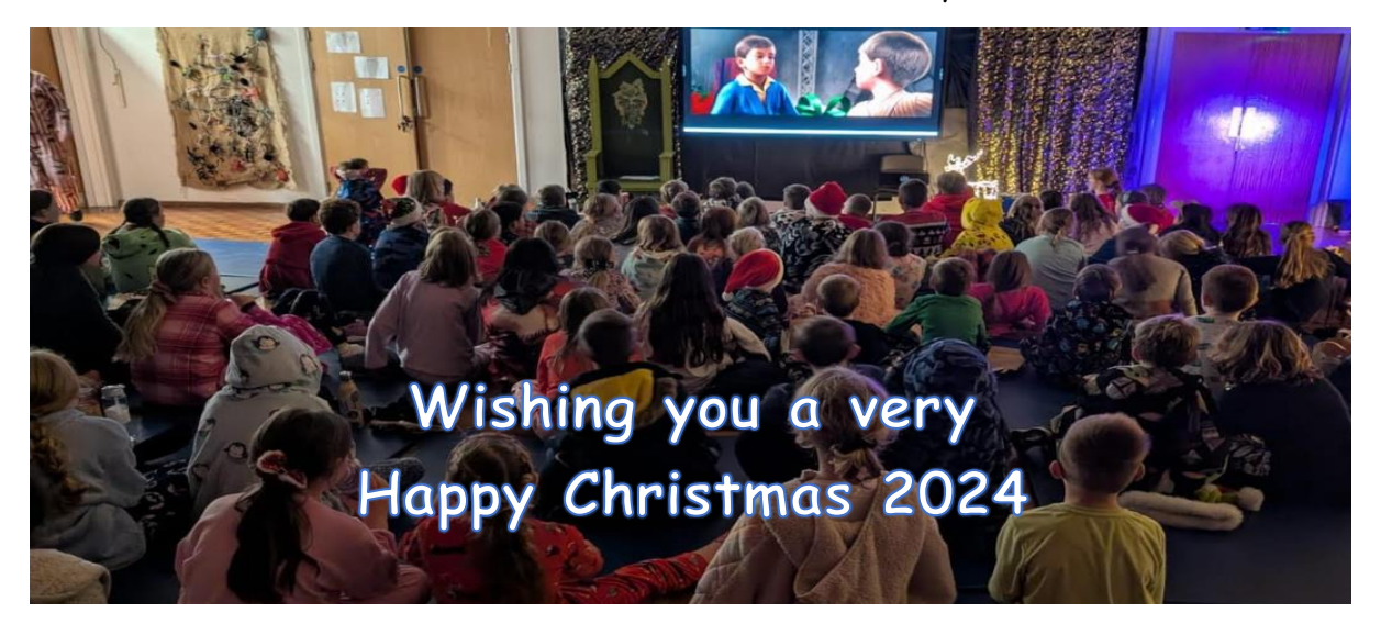
Don't forget the children are back to school on Tuesday 7th January.